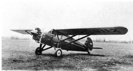
Fig. 315. Travel Air model "6000" with Wright J5 engine; later converted to model "B-6000" with installation of Wright J6-9-300.

This chapter marks the close of this first volume, a volume depicting the growth of the aircraft industry from a rather shaky and apprehensive start to one that had gained confidence in itself, and began to snow-ball into one of the major industries in this country. Volume Two has us on the threshold of the year 1929, certainly the most memorable and unusual year in the annals of the aircraft industry; it should be interesting and worthwhile to follow this progress.