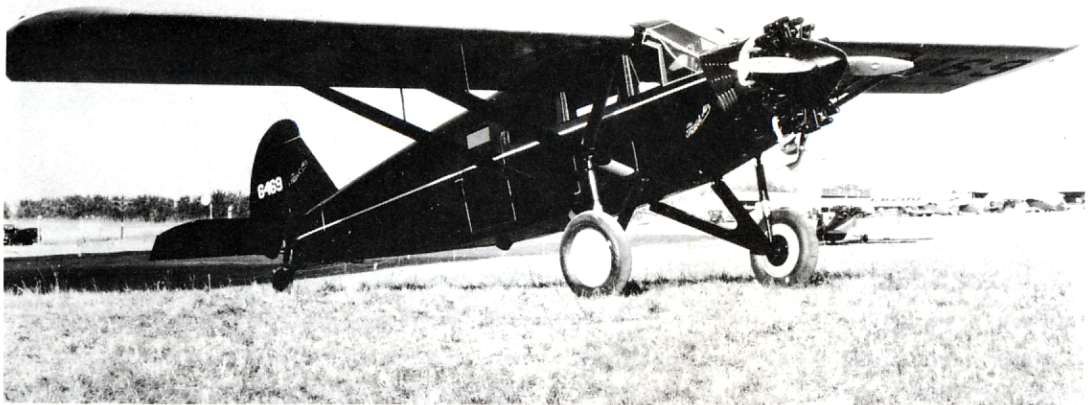
Fig. 312. The "Travel Air" Model 6000 carried six in comfort, designed to meet the needs of business firms and smaller air lines.

Walter Beech and his enthusiastic crew at "Travel Air" let it be known that they were mighty proud of the model "6000" when it was introduced early in 1928; they were proud and justifiably so, because it was a big beautiful airplane that incorporated the very latest features expressly designed to promote a better acceptance of the convenience and comfort of travel by air. They even went so far as to dub it the "Limousine of the Air" and it was, in a sense, with its roomy interior and pleasant appointments that were coupled to an air about it that could be best described as luxurious efficiency, whether on the ground or flying.