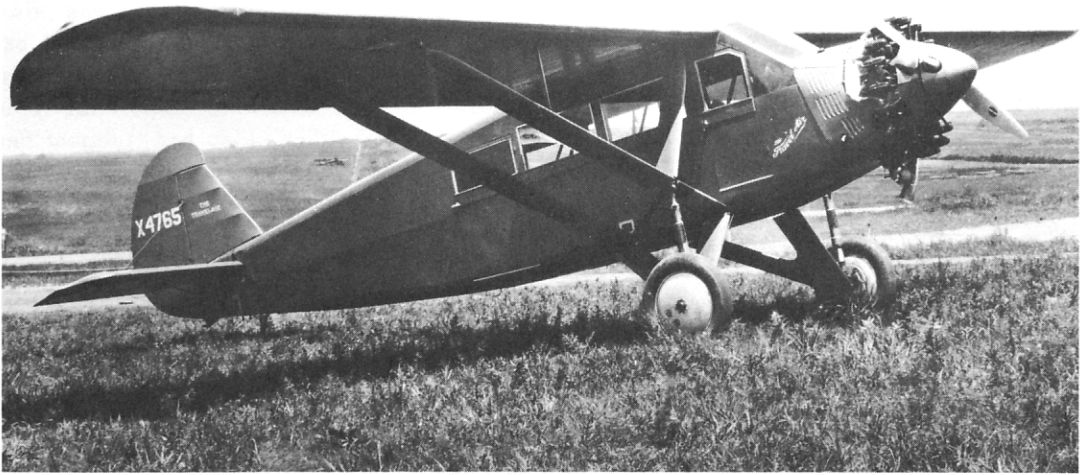
Fig. 313. 1928 prototype version of the "Travel Air" Model 6000, proudly announced as the "Limousine of the air".