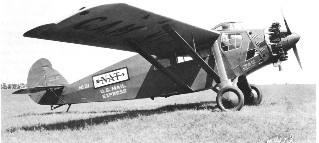
Fig. 314. The colorful "Travel Air" Model 5000 was one of the first to offer air-travel in cabin comfort.

more suitable to promises extended. Notable among these improvements was an enlarged cabin section for more elbow room, with roll-down windows, removable seats for hauling cargo, and non-shatter safety glass in the pilot's section of the cabin. The tail-skid was replaced with a 14 x 3 steerable tail-wheel, and the rudder shape was modified with a cut-out to suit. The Model 6000 was manufactured by the Travel Air Co. at Wichita, Kan. who was adding new buildings to their plant layout every month or so; it was getting to be the biggest commercial aircraft producer in the country.