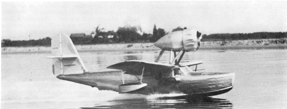
"Sea Bird" skims over water on take-off.