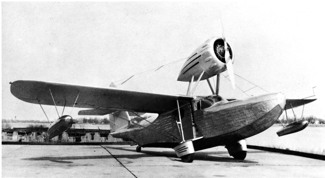
Fleetwings "Sea Bird" was at home on land or water.

The silver "Seabird" by Fleetwings was pretty much an unusual airplane, but unique mainly because it was built of "shot-welded" (spot-welded) stainless steel construction. It was not the first airplane to be built up in this manner, but it was the first airplane of "stainless" to be awarded an ATC approval, and the first airplane of this type to be built in any number. The Budd "Pioneer" seaplane, identical to the Savoia-Marchetti SM-56, was the first to be built of stainless steel in 1931; it was actually lighter and stronger than the airplane it duplicated. Years of severe testing proved it to be practically ageless. The initiative for this departure from normally used materials came from the steel industry. Much development money was gambled in hopes that more steel could be used in airplane structures, thereby developing a new market for steel sheet. Intrigued with the possibility of building a strong, efficient airplane of stainless steel, Fleetwings experimented for several years to perfect fabrication methods, and the design of structural members best suited for the unusual properties of stainless steel sheet. No doubt, Fleetwings, Inc. picked the "amphibian" as their first airplane to produce because a water-going airplane would certainly be the test for this type of construction, and the many innovations it promised. Jim Reddig, who had long been associated with plane builder Grover Loening, was picked to design the airplane, an airplane which