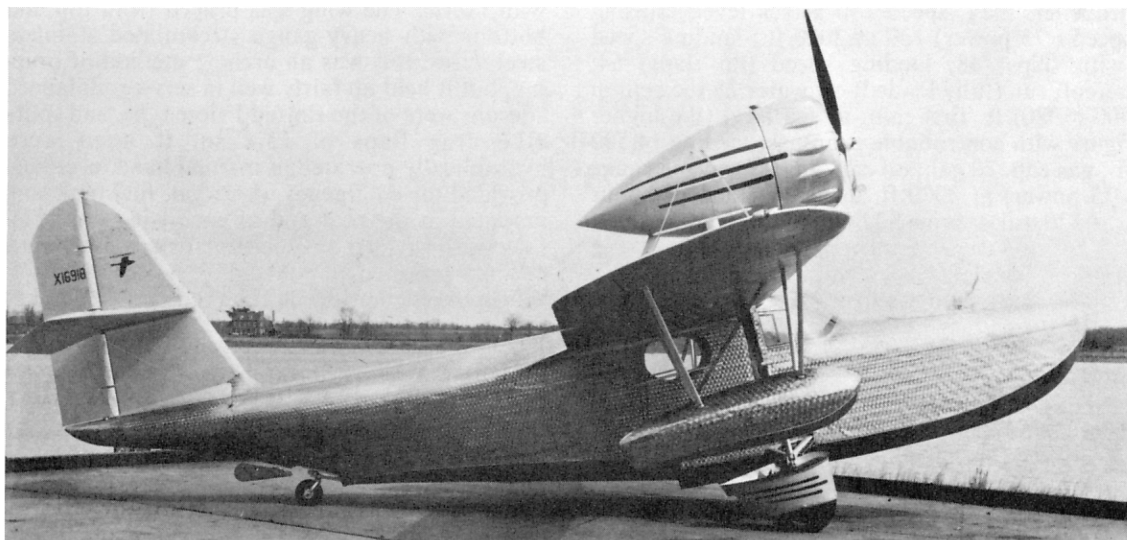
High mounting of Jacobs engine produced top-heavy moments.