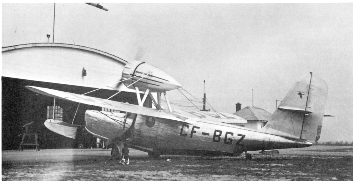
A "Sea Bird" operated by mining company in Canada.